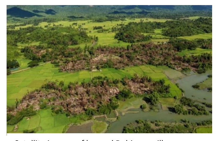
Satellite images of burned Rohingya villages, September 2017

from forced labor, rape, and religious persecution since the 1990s.